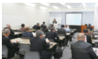
Provision of information

Using this newsletter, I would like to express my gratitude to each lecturer for their cooperation in providing very useful information as references.