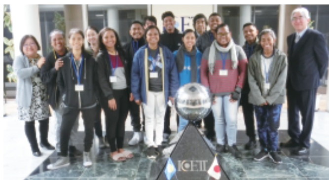
Opening of the program at ICETT

Since the State of Koror, where Palau High School is located, has a concentration of more than half the population of Palau, and a serious waste problem due to an increase in the number of tourists with its many tourist attractions, environmental conservation against the backdrop of this country's waste management problem was selected as the theme of this program. Palau High School has integrated many scientific elements in its curriculum based on a policy of the country's Ministry of Education. All the participants who belong to the science club of this school have an interest in science and technology in various fields, and have a strong concern about waste reduction as well. In the program, they learned about various cases of science and technology related efforts being made in Japan from the perspective of environmental conservation.