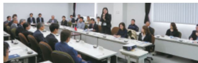
Keynote lecture by the delegation leader

We, ICETT will continue to steadily provide support for companies also in the future, while valuing connections between individuals.