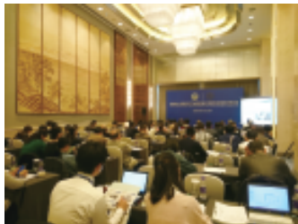
Environmental Conservation Seminar

For two days on October 16 and 17, 2018, we held a seminar in Tianjin City, attended by 119 people, including representatives from the Tianjin Environmental Protection Bureau and researchers. Specialists from Tianjin City made presentations concerning the current conditions of Tianjin City's water environments, and specialists from the Japanese side made presentations on "Japanese laws related to water pollution and related management mechanisms," "Method of removing heavy metals from wastewater and matters to be noted when operating and controlling wastewater treatment facilities," and "Technology to remove organic and toxic pollutants using a physico-chemical treatment method." In the final session of the second day, an open discussion regarding wastewater treatment in industrial parks was held.