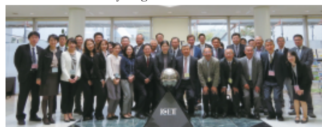
Participants from both the Japanese and Taiwan sides

In relation to the fact that we have accepted another Delegation members in the past, we introduced some Japanese companies in the Chubu region, and coordinated a study tour this time upon request by the Delegation team. Also, we held an environmental business exchange meeting with related companies in Japan with the aim to promote cooperation in resource recycling businesses.