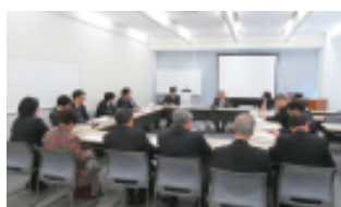
Exchange of opinions