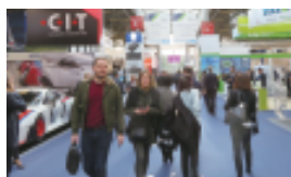
JEC World 2019 Exhibition in Paris ①

Based on the background above, we implemented this project with the aim to provide support through industry-university-government cooperation for the identified regional core companies in the Chubu Region, with excellent CFRP in-plant waste recycling technologies that can meet a wide range of needs from developed countries including Europe and U.S., in order for them to promote their sales channel expansion in both Japan and overseas and find and establish their technical collaboration partners.