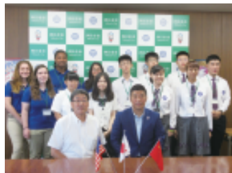
Courtesy visit to the mayor and city council chairman

of this workshop is to deepen international exchanges in cultural areas. In fiscal 2018, students experienced the tea culture at Kabuse-cha Café, as well as deepened their exchanges with families who operate tea farm and Kabuse-cha Café.