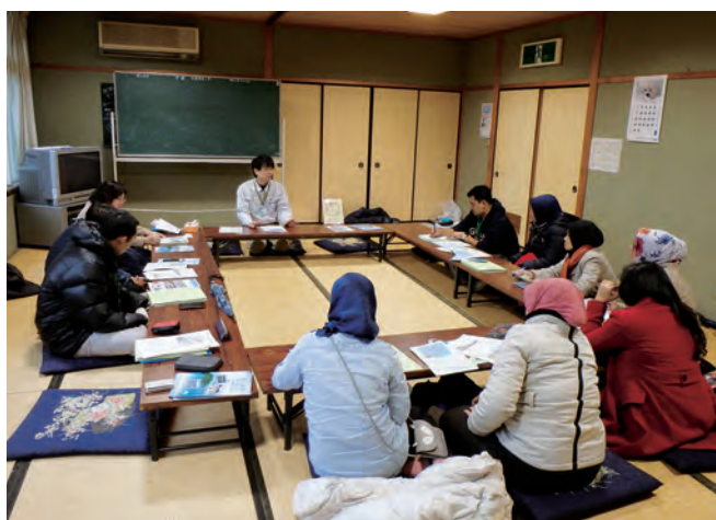
Discussion with Toba City about marine debris (Indonesia)

They also saw local community association members collecting and sorting recyclables and visited a family living close to ICETT. They seem to have realized that local residents play an important role through their eco-friendly activities to reduce waste and to promote recycling, contributing to improvement of the environment.