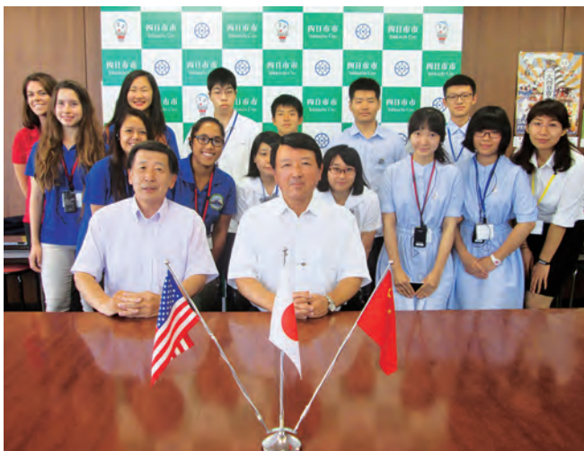
Visited Mayor Tanaka and Committee Chairperson Murayama (Urban/Environmental Committee)

At Yokkaichi Pollution and Environmental Museum for Future Awareness, the students learned about the history of Yokkaichi pollution and how it was gradually overcome through measures to improve the environment taken jointly by the citizens, companies and government. They also visited Yokkaichi City Clean Center, which opened in April 2016, to learn about the treatment of combustible waste, how the thermal energy generated by combustion is utilized, as well as how slag and waste metals are reused in its latest