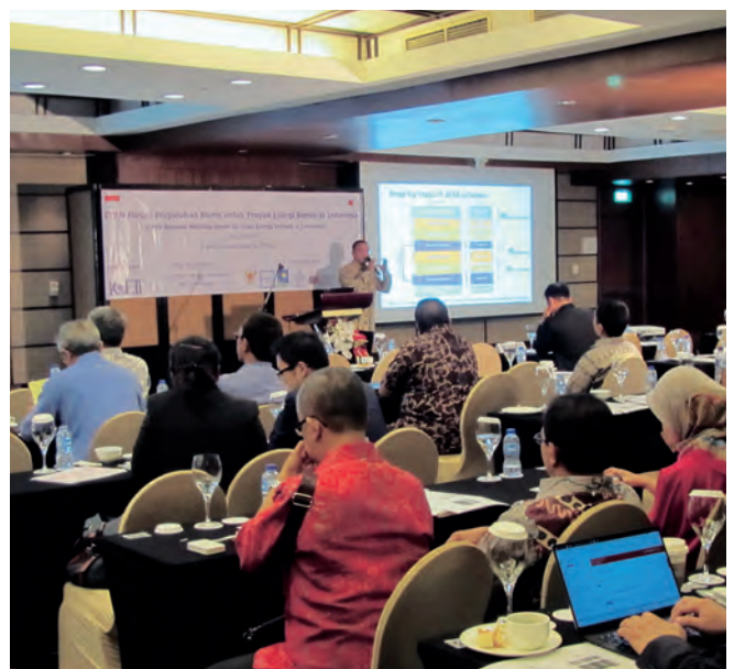
Business Matching Forum in Indonesia