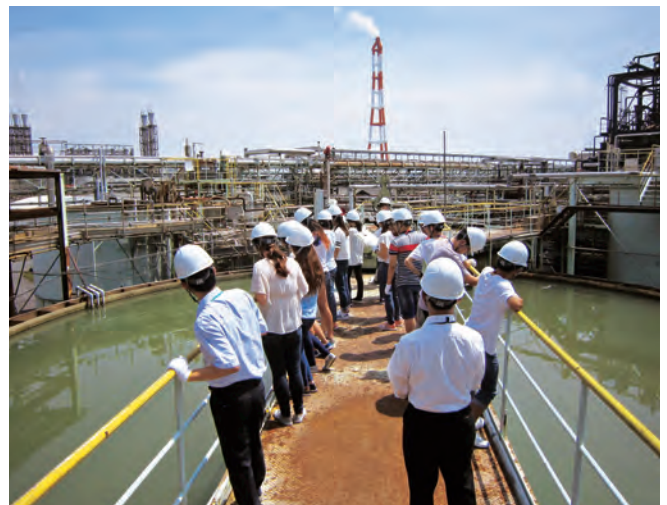
Visited a company in the city's industrial complex

The new program tried in this project this fiscal year was the exchange and learning program with students from Escolapios Kaisei Catholic Senior High School. Kaisei Senior High School students planned an environmental learning activity in which the participants of Global Environmental Workshop participated for deeper exchange by playing an environmental conservation-related game. They also visited Yokkaichi Port Building and learned about air/water pollution control in the port when they rode on the port patrol boat “Yurikamome”. During a visit to a chemical factory in the city, they also found out how air/water pollution is controlled there.