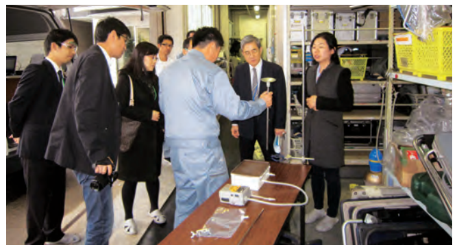
Scene at training in Japan

A training course was also held in Kobe City, another friendship city of Tianjin, to learn about cases from a different city in Japan. The participants also visited other companies undertaking soil/ground water pollution control, measurement certification bodies, facilities to treat polluted soil, etc. to learn practical issues directly related to their work.