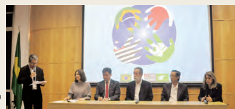
Seminar in State of Sao Paulo

In May 16, 2017, Sao Paulo State Health Bureau held a seminar entitled "Cooperation of Sao Paulo State and Mie Prefecture : Health and Environment" in State of Sao Paulo and the three participants reported on the achievements of the course. A video was shown of greetings from Director of Department of Environmental and Social Affairs of Mie Prefectural Government and ICETT Executive Director as well as the Japanese industry waste disposal system with explanations by Mie government staff. Approximately 120 attendees related to the administration and Mie Prefectural Association, etc. attentively listened to the participants' reports and had active discussions.