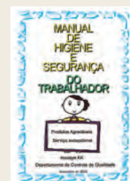
Employee manual of Imuraya Co., Ltd.

These two companies have promoted the 5S activities to ensure "strict food sanitation and safety management", and the persons in charge told us that "it has improved organizational behavior" and "the reporting meetings for 5S activities held twice a year serve to raise awareness and raise opinions among employees". Practice of the 5S activities is highly recommended.