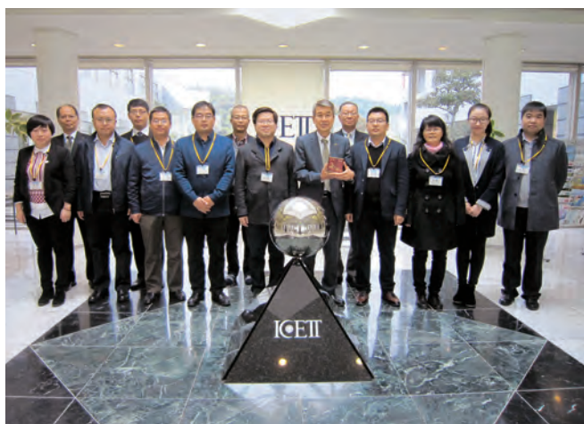
Program opening ceremony (China)

The “Japan-Asia Youth Exchange Program in Science” (Sakura Science Plan) was launched in FY2014 by JST aiming to invite outstanding young people from other Asian countries for deeper exchange in the field of science and technology between these young people and young Japanese, who are all to become future leaders. It also aims to raise interest in the latest science and technology to contribute to fostering outstanding human resources in overseas countries needed by universities, research institutes and companies in Japan and for scientific and technological development in Asian countries including Japan. ICETT invited environmental conservation researchers from Gansu, China and Indonesia to implement training programs under the respective themes of “Promotion of eco-friendly agriculture and organic food production” and “Local environmental management, mainly water quality and solid waste management”.