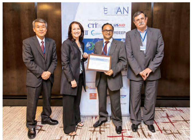
Best Award winner (second right)