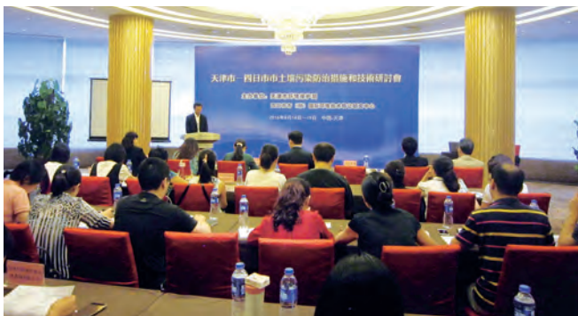
Scene at environmental protection seminar

A seminar was held in Tianjin for two days from August 18 and 19, 2016. In the seminar this fiscal year, experts from Tianjin reported on the current conditions there. Later the "laws/regulations and measures to control soil/ground water pollution", "technology to control soil/ground water pollution", "cases of control of soil/ground water pollution by chemical plants" and "generating mechanism of oxidant and method of its control" were reported on by specialists from Japan. A free discussion was also held at the end, concerning soil pollution control.