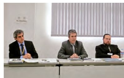
Participants (at ICETT)