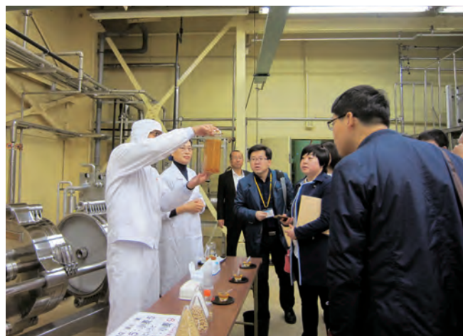
Visit to organic food plant (China)

In the middle and later stages of the training, they visited organic food plants and agricultural facilities with scientific technology to hear about workers' challenges and creative ideas and to discuss issues to introduce them into Gansu. An important feature of the agricultural facilities they visited was the closed or semi-closed indoor farm field with a computer-controlled environment, which makes it possible to have a stable volume of vegetable and flower production throughout the year. As this can be applied to cold or dry regions not suitable for outdoor plant growth, the participants also had numerous questions about the equipment, operating costs and the quality of the products.