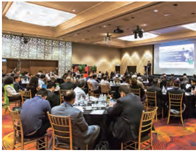
Financing Forum (in Singapore)

The Forum had a total of 151 participants including investors, financial institutions and investment consulting firms, and provided beneficial networking for investors interested in business developers and related areas. After the Forum, there were inquiries concerning investment for the projects and we are still continuing our support for fund procurement.